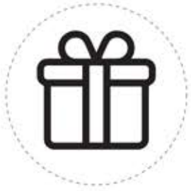
Give a gift