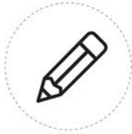
Share a pencil