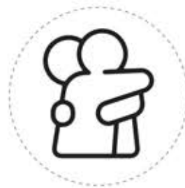
Give a hug