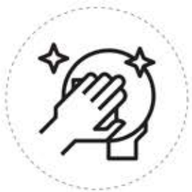
Do the dishes