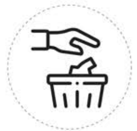
Pick up rubbish