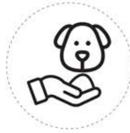
Feed a pet