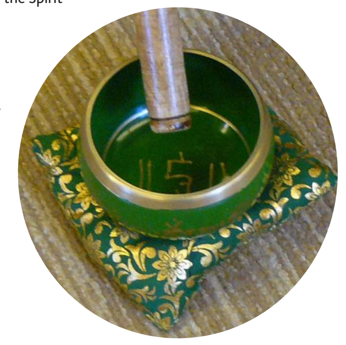
A singing bowl used for Christian meditiation at St Mary's School, Rotorua

My hope is that as they grow into adulthood, meditation will become part of their everyday life.