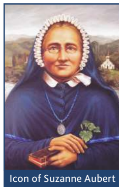
Icon of Suzanne Aubert

The Sisters, and the staff they inspire, are committed to deliver compassionate care throughout their community by providing meals, food and basic needs to those who have very little; caring for the elderly, and providing individual and family support. They are committed to supporting those of all creeds and none.