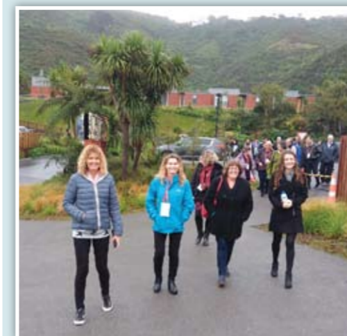
Convention attendees at Island Bay

Over 120 educators made a pilgrimage following in Suzanne Aubert’s footsteps during the triennial Catholic Education Convention in June. The first stop on the tour was Buckle Street, where Suzanne began her work in Wellington in 1899. Her historic crèche is now restored as the Pukeahu Education Centre and here educators were introduced to the Compassion Schools programme and the dream that all students will visit this and other significant places at least once in their thirteen years of Catholic Education. The next stop was the Compassion Soup Kitchen around the corner in Tory Street. In the dining room, Soup Kitchen staff spoke of today’s needs and their response which includes serving breakfast and dinner 6 days a week to all who seek it. The final stop was Our Lady’s Home of Compassion in Island Bay. Pilgrims kept the silence of the Chapel as they entered and experienced the wairua of this sacred place.